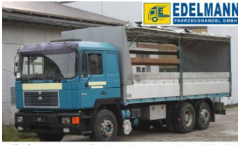
Visit us under www.e-truck.ch