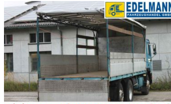
Visit us under www.e-truck.ch