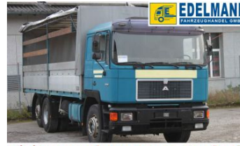
Visit us under www.e-truck.ch